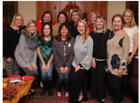
The Greater Birmingham Republican Women hosted a Christmas party in Hoover with the Jefferson County GOP.