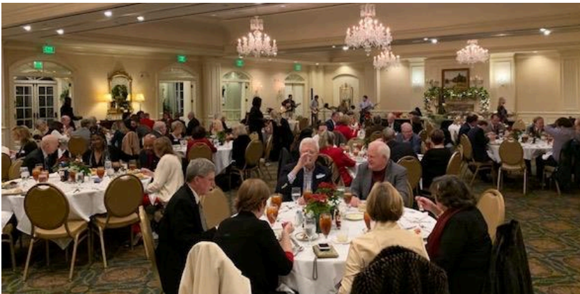
The Montgomery County GOP had a great turnout at their annual Christmas party in Montgomery.