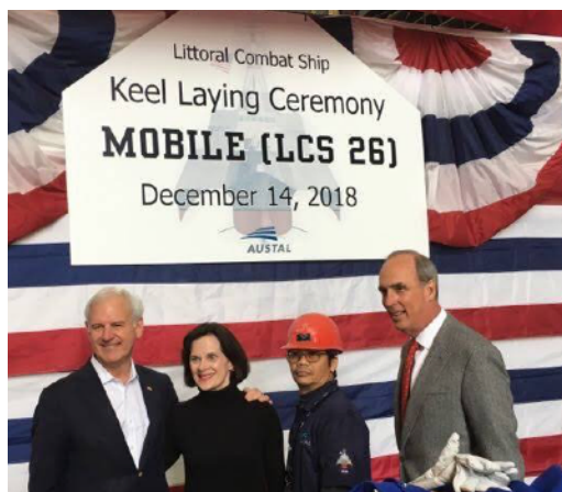
U.S. Congressman Bradley Byrne attended the Keel Laying Ceremony for the USS Mobile at Austal Headquarters in Mobile.