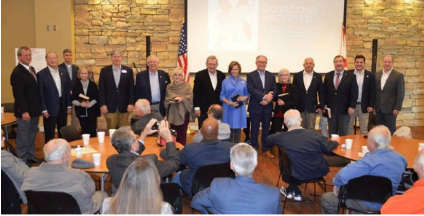
The Mid Alabama Republican Club held a GOP legislative swearing in ceremony at their November monthly meeting in Vestavia.