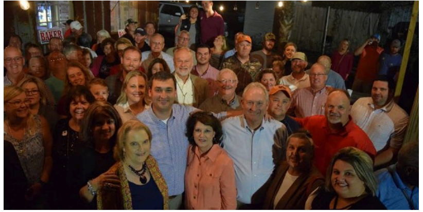
The Escambia County GOP celebrated their wins at their 2018 election party in Brewton.