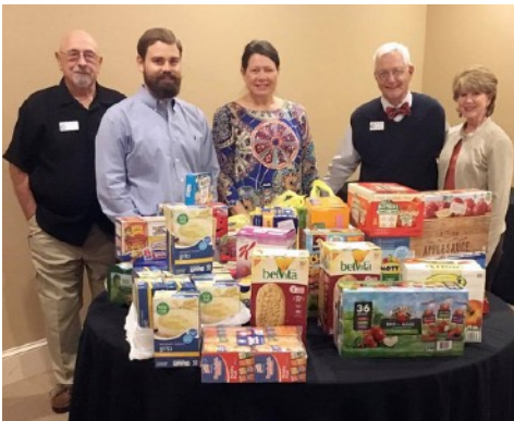
The Dale County GOP gathered food to donate to Backpack Buddies of Alabama's Fall Food Drive.