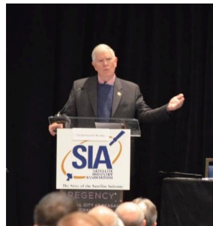
U.S. Congressman Mo Brooks was the keynote speaker at the Satellite Industry Association's conference in Washington, D.C.