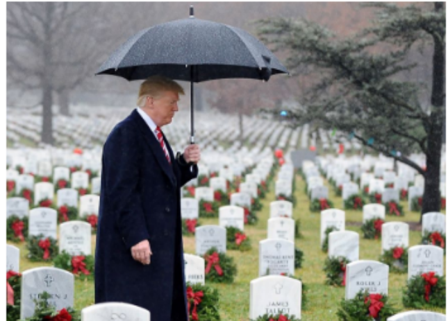
President Trump visited Arlington Cemetery on Wreaths Across America Day to honor the memory of our nation's heroes.