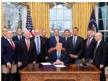
U.S. Congressman Mike Rogers attended the signing of the Frank LoBiondo Coast Guard Authorization Act of 2018 at the Oval Office in the White House with President Trump.