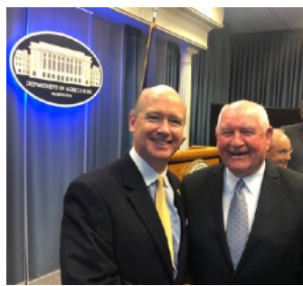
U.S. Congressman Robert Aderholt joined U.S. Secretary of Agriculture Sonny Perdue to announce the USDA's new ReConnect Program in Washington, D.C.