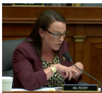
U.S. Representative Martha Roby questioned Google CEO Sundar Pichai during his testimony to the House Judiciary Committee regarding the company's privacy policies and advertising data.