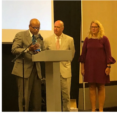
The Boys and Girls Club of Alabama honored Congressman Robert Aderholt with the Champion Award .