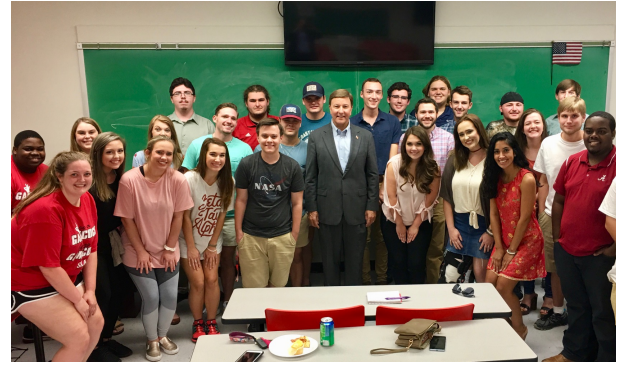
Congressman Mike Rogers spoke to the Jacksonville University College Republicans.