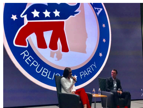
Candace Owens and Charlie Kirk of Turning Point USA were the dinner keynote speakers - the youngest speakers to ever address the ALGOP.