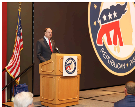
Senator Richard Shelby addressed dinner attendees on the importance of confirming Judge Kavanaugh to the U.S. Supreme Court.