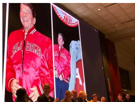
Something everyone at the 2018 ALGOP meeting could agree on, Ronald Reagan and Alabama football.