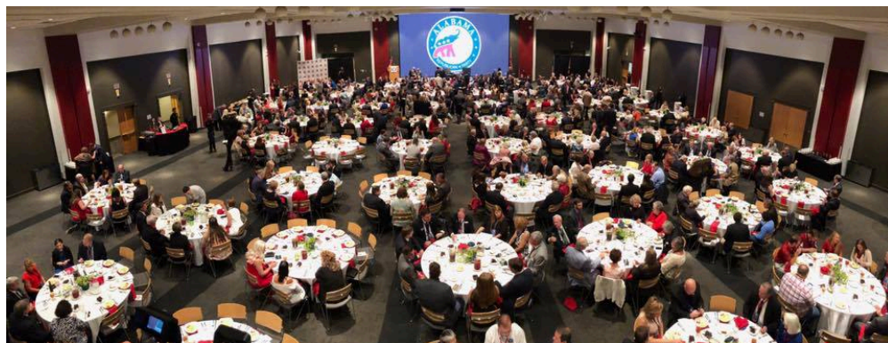
The 2018 ALGOP Summer Dinner was held in Tuscaloosa at the Bryant Conference Center on the Campus of the University of Alabama.

The ALGOP appreciates the Tuscaloosa County GOP for their help and sponsorship of the University of Alabama bus tour.