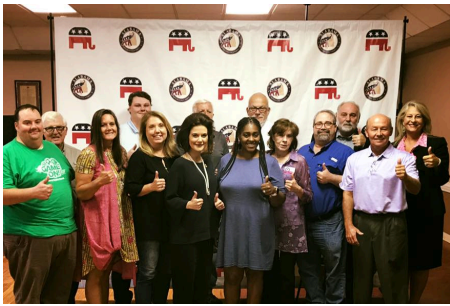
The RNC program, the Republican Leadership Institute and the ALGOP, held training sessions in Cullman, (left) and in Montgomery (right) to help volunteers prepare for the 2018 elections.