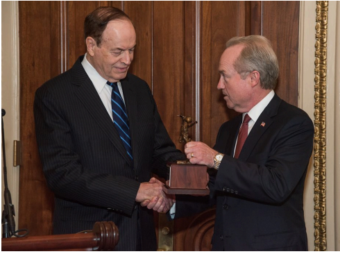
The Aerospace Industries Association presented Senator Shelby the Wings of Liberty Award for prioritizing national defense policy.