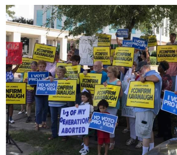
Alabama Republicans gathered in front of Senator Doug Jones' Mobile office to support Judge Kavanaugh's confirmation to SCOTUS.