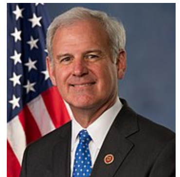
Congressman Gary Palmer (left) and Congressman Bradley Byrne (right) were also named a " Hero of Main Street " by the National Retail Federation for their support of our nation's small businesses.